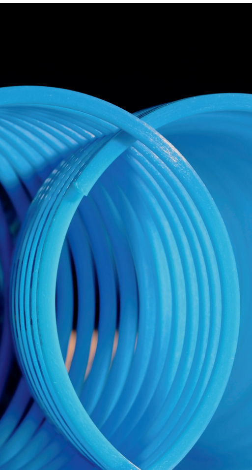
Illustration of a potential subject

One example of how this international exchange of ideas can lead to practical and lucrative approaches for companies doing business in the U.S., is the growing interest in European-style apprenticeship programs as an “old idea for the new (U.S.) economy” .